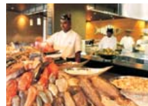
The Lagoon Seafood Market Lunch and Dinner Ground Floor