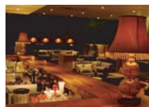
Sequel Champagne Bar 9 a.m - 12 midnight Ground Floor