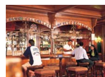
Cheers Pub British style watering hole 11.00 a.m - 02.00 a.m Ground Floor