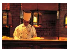
London Grill Fine dining 7.00 p.m - 11.00 p.m Ground Floor