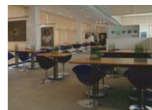
The Cafe Healthy Eating 6 a.m - 10 p.m Rooftop