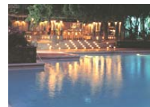
Breeze Bar Cocktail bar 10.00 a.m - Midnight Ground Floor