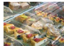
Coffee Stop Piazza Café 7.00 a.m - 2.00 a.m Lobby