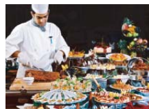
The Taprobane Coffee Shop 24 hours Ground Floor