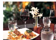
TAO Asian Fusion cuisine 7.00 p.m - 11.00 p.m Ground Floor