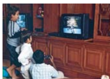
Cheers Kids Club Children's Restaurant Open 11 a.m - 9 p.m Ground Floor