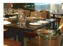
Echo Authentic Italian Cuisine Lunch and Dinner Ground Floor